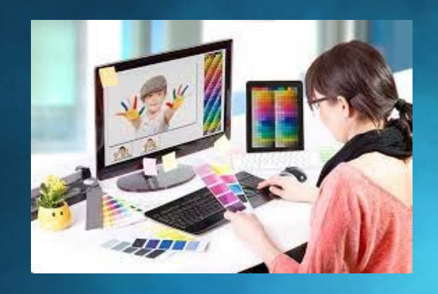
Graphic Designers/ Illustrators