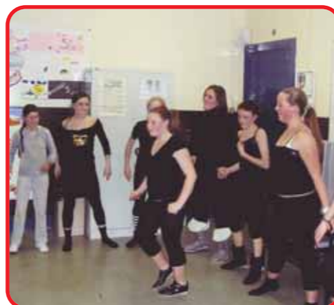
First year students go through their paces in preparation for the JCSP Christmas Celebrations.

Debs: In September our most recent past pupils celebrated their Debs in the Red Cow Inn. The night was a great success and everyone who was present thoroughly enjoyed the celebration.