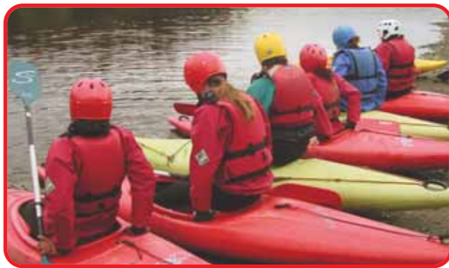
5B and 5F canoe students face the plunge – what are they thinking?