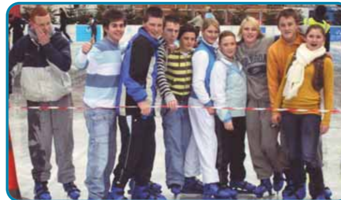
Ice Skating: 6F and 6B Ice Skating on the outdoor rink at Smithfield in December.